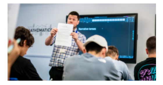
Improve your English skills