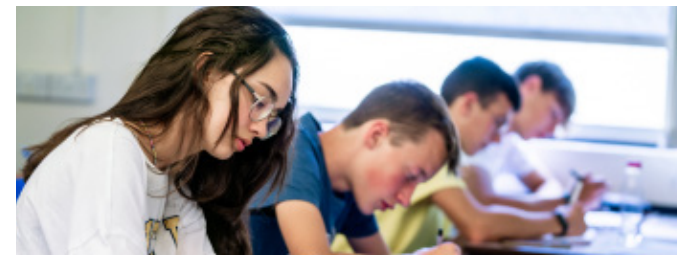
*Please note for students that are A1 or C2 , please enquire about class placement as this is dependant on student numbers.