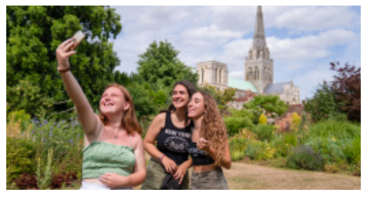
Students posing by the Chichester Cathedral